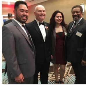
249 th Annual Dinner – April 2019

The OBMG is proud to have The Marine Society of the City of New York as a committed partner and as an Annually Pledged Commodore Donor.